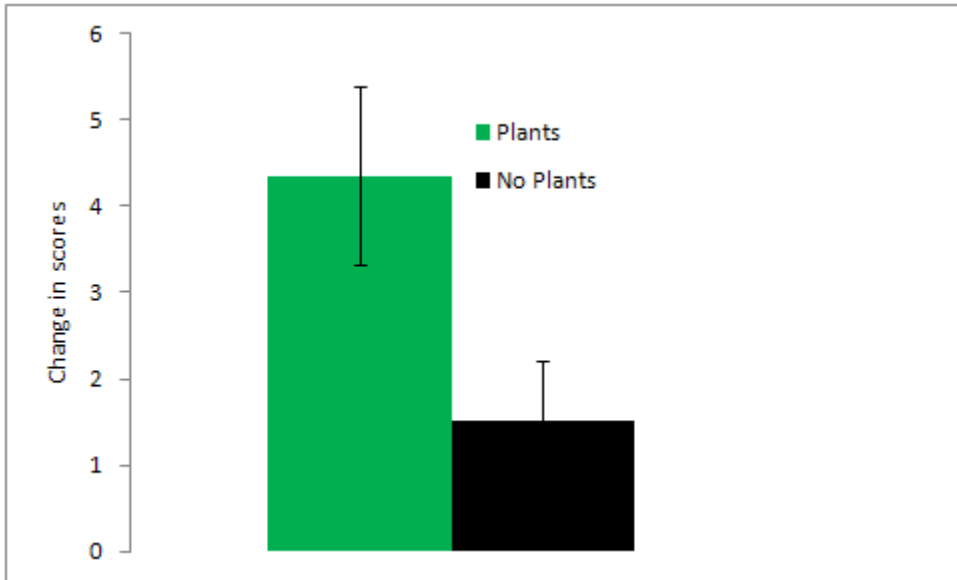
Figure 2. School A Comparison of end of term spelling scores, in classes with and without plants.(Means and SE; n = 69-72.)